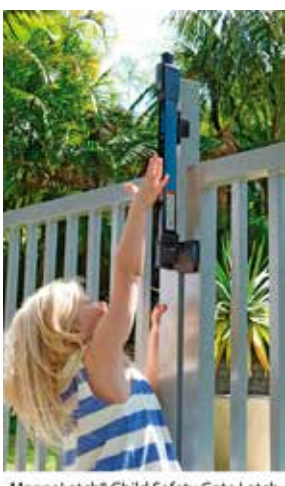
MagnaLatch* Child Safety Gate Latch