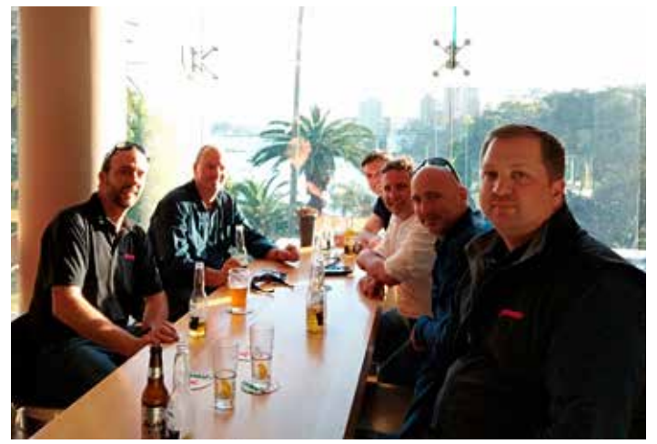
Enjoying a brew in the Sydney sunshine.