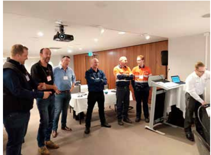
Delegates line up to test their welding skills.

Delegates eventually were able to enjoy the sensational Sydney weather, with some drinks and dinner overlooking Wendy Whiteley's Secret Garden and Lavender Bay. Thanks go to Weld Australia and the Kirribilli Club for making the day run so well, and also to InfraBuild Wire for their generous part-sponsorship.